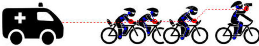
Figure 1: Body-to-Body Network for U-Health monitoring of a group of cyclists.

3) Challenges : The major challenges for BBN are: the energy efficiency, when the coordinators will play the role of cluster head and will transmit the value or vital signs in the case of a medical application to other WBAN within a group. Then the routing of collected sensor data through neighboring WBANs until the destination, with QoS considerations and ability to support WBANs mobility, is a second issue. Yet, the data generated and transmitted in a BBN must have secure and limited access. Anyway, people can see the BBNs such as a threat sources on their data and private life, their acceptance is the key of the success of BBNs. Finally, all data residing in mobile WBANs or patient sensor nodes must be collected and analyzed in a seamless fashion. The vital patient datasets may be fragmented between some nodes, but if the node does not contain all known information the level of patient care may be not so good.